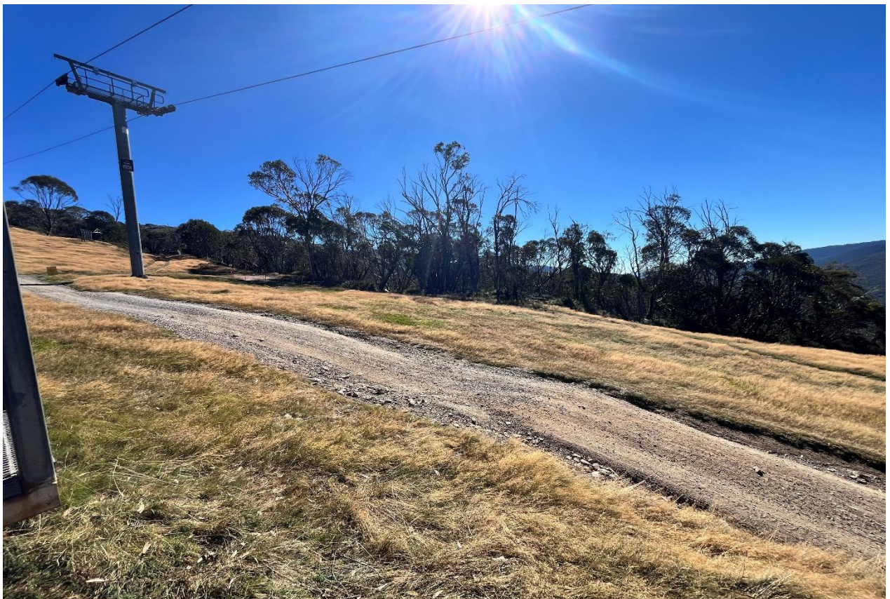
Photo 2: The new earth mounds will be within the existing heavily disturbed ski slopes, with the largest mound between a small tree island and the extensive forest to the east of the ski slope.